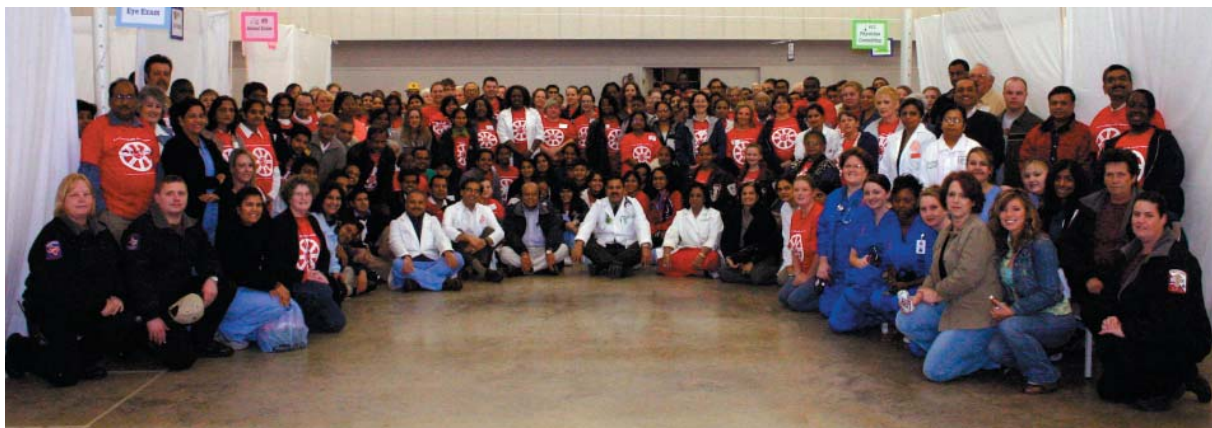
Before the doors opened to medical camp attendees, the volunteers gathered for a group picture.